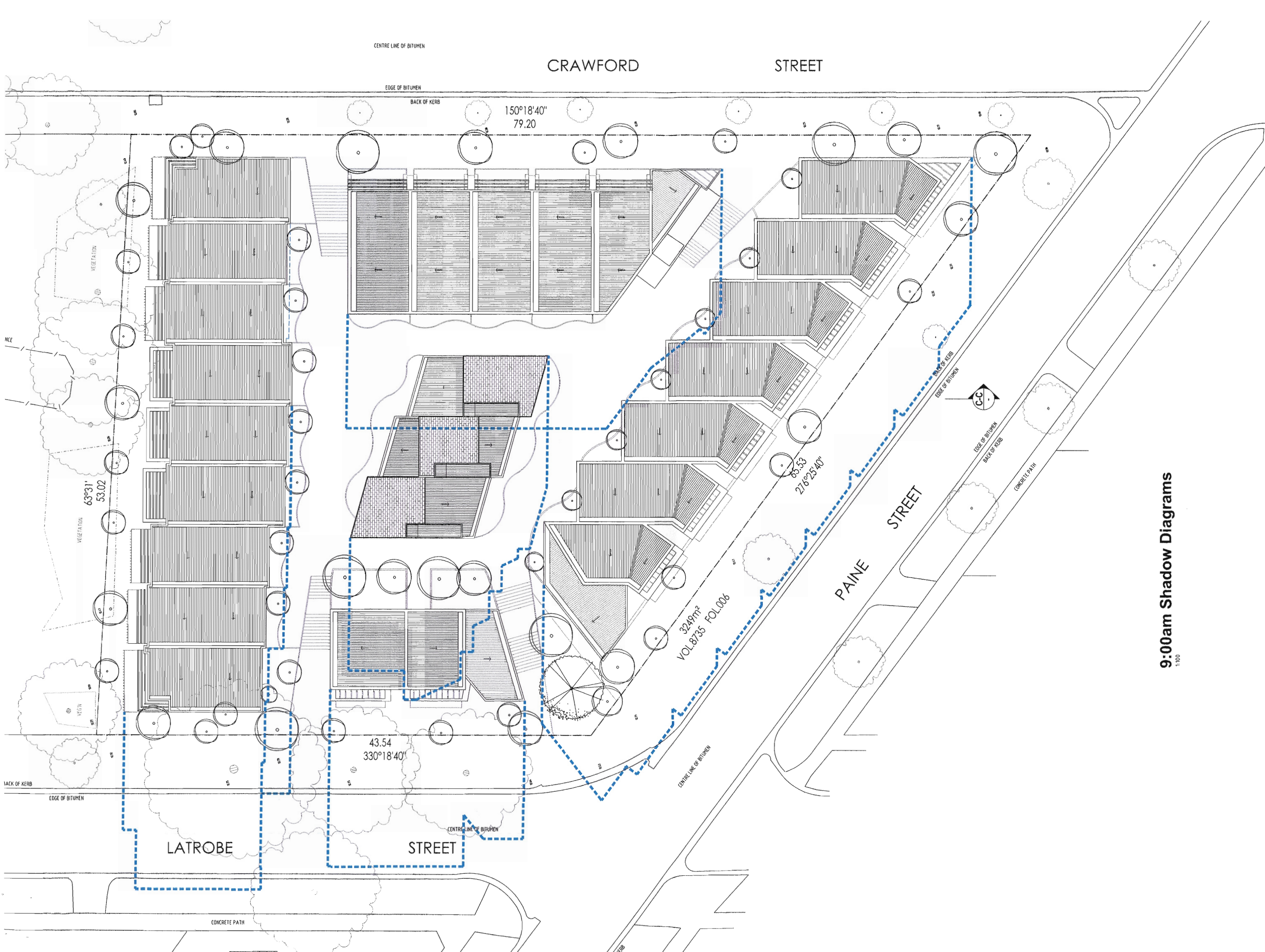
9:00am Shadow Diagrams 1:100